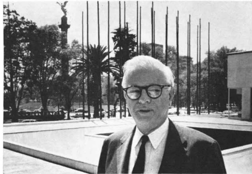
Alfred Winslow Jones

There are reasons to believe that the best professional manager of investors' money these days is a quiet-spoken, seldom photographed man named Alfred Winslow Jones. (The picture above was taken while he was on vacation in Mexico City recently.) Few businessmen have heard of him, although some with long memories may remember his articles in FORTUNE; he was a staff writer in the early 1940's. In any case, his performance in the stock market in recent years has made him one of the wonders of Wall Street—and made millionaires of several of his investors. On investments left with him during the five years ended last May 31 (when he closed his 1965 fiscal year), Jones made 325 percent. Fidelity Trend Fund, which had the best record of any mutual fund during those years, made "only" 225 percent. For the ten-year period ended in May, Jones made 670 percent; Dreyfus Fund, the